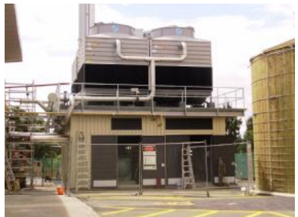
The new Energy Centre Annex

The Cooling Tower project is an upgrade of the existing Energy Centre Annex (ECA), which will increase its capacity to service the soon to be started Clinical Services Building (CSB). The ECA will house a new boiler and chiller for the production of hot and cold water for the purposes of running air conditioning systems. As part of the project a new bulk domestic water storage tank has been constructed along with some enabling works to facilitate the construction of CSB: Stage 1 – Phase 1.