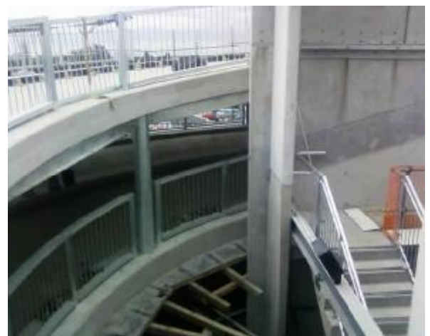
The ramps and stairs have been completed on Levels 3 and 4