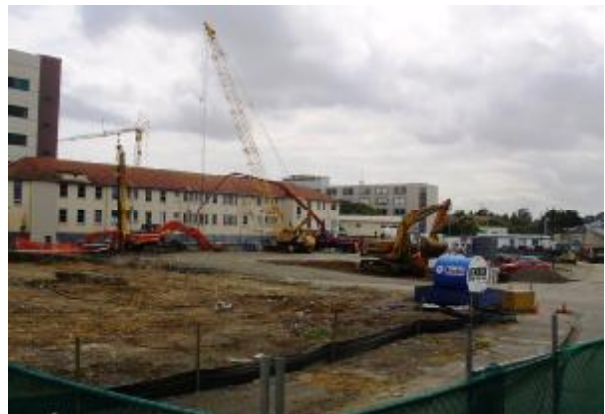
CSB Stage 1 - Phase 1 site to be excavated