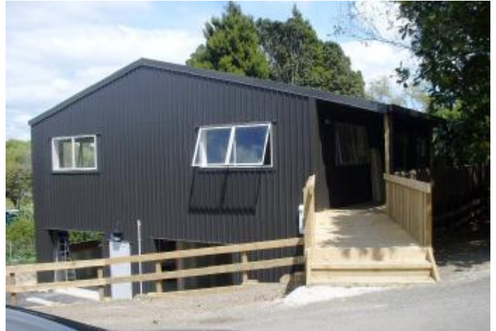
Building 53 – just across from Tiaho Mai

Congratulations on the smooth move. We're glad everyone has settled in well.