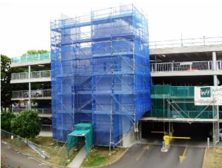
Level 3 is now open

CONSTRUCTION UPDATE: Level 3 of the Western Campus Carpark is now open with Level 4 opening in January 2011. Once the car park is complete work will resume on the temporary ground level carpark which will be sealed and marked.