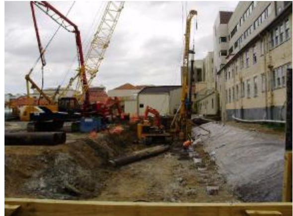
Construction of piles

Many thanks to all of the staff working in the buildings that surround the construction zone. We realise that you have had to deal with varying degrees of noise and activity and we thank you for your patience.