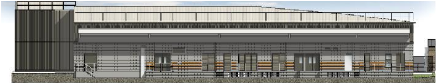
Middlemore Hospital Clinical Services Building Phase 1 South Elevation

Completion Stage 1 – Phase 1: Late 2011. Completion Stage 1 – Phase 2: Late 2013